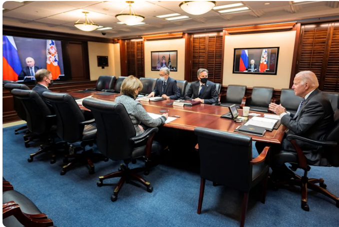
U.S. President Joe Biden holds virtual talks with Russia's President Vladimir Putin amid Western fears that Moscow plans to attack Ukraine, as Secretary of State Antony Blinken listens with other officials during a secure video call from the Situation Room More